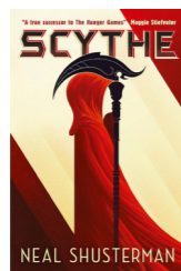
Author: Neal Shusterman Publisher: Walker Books